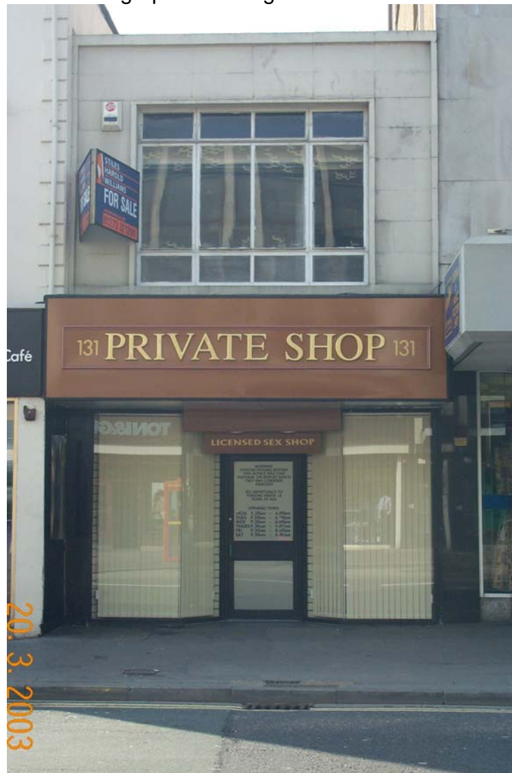
Photograph of frontage of 131 Above Bar